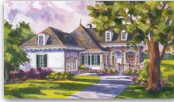
Hall Park II

KENT select A SMARTER WAY TO A LUXURY HOME