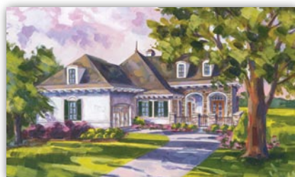
Hall Park II