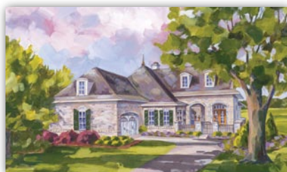
Hall Park I

England is known for elegant gardens, and the courtyard entry of this plan, while optional, makes a statement straightaway. The Hall Park Hotel, in the town of Workington centrally located in the lake district of Cumbria, inspired this home's level of comfort and easy-living style. A cozy library on the front of the home has attractive French doors that also open onto the covered entry. Diagonally opposite the entrance is the loggia with an optional pool. The interior is open and airy, but the very luxurious master retreat is tucked away for maximum privacy.